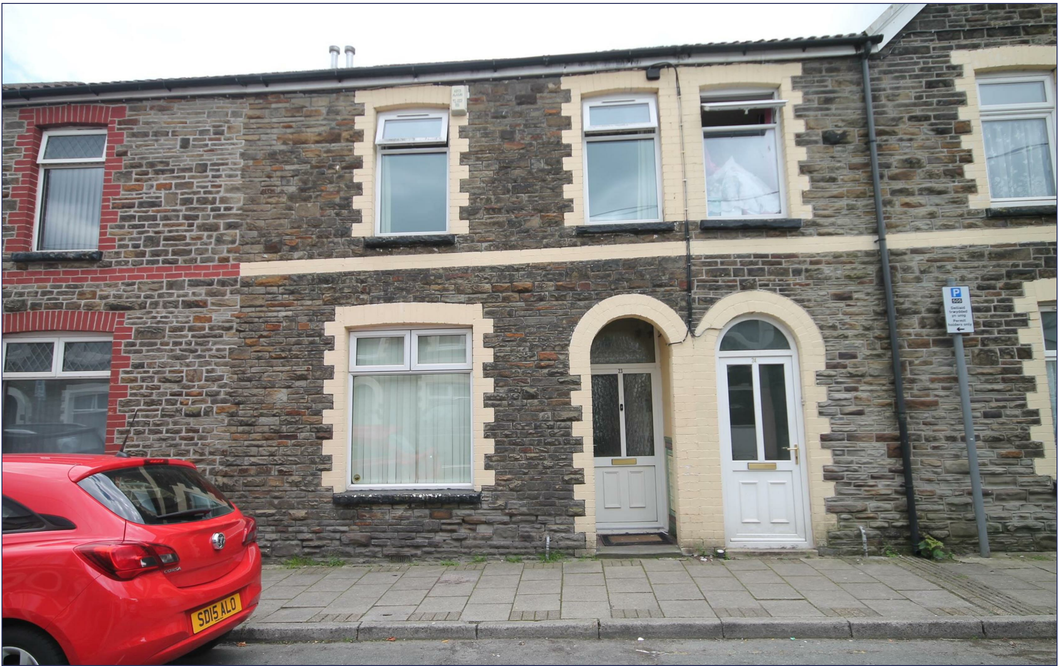
23 Windsor Street, Caerphilly, CF83 1FW Offers Invited £230,000