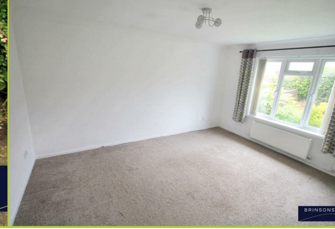
92 Ty Llwyd Parc Estate, Treharris, CF46 5LB Price £250,000