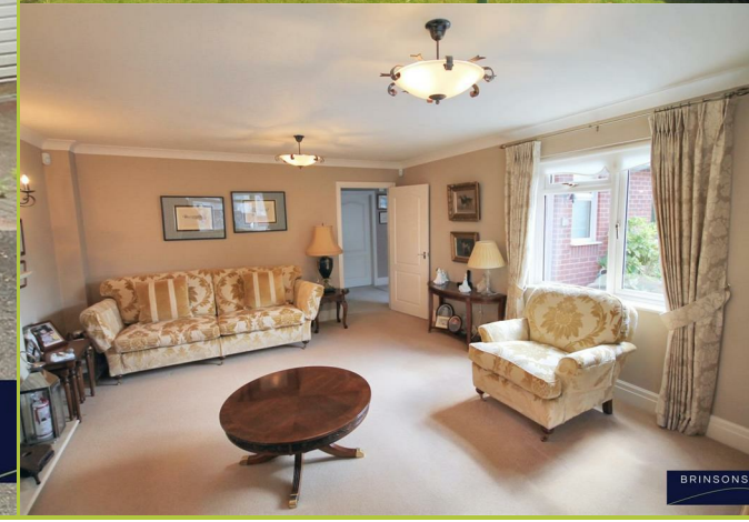
8 Bryn Derwen, Caerphilly, CF83 2UZ Price £550,000