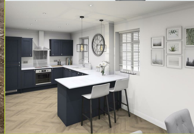
Clos Y Rheithordy High Street, Nelson, CF46 6HA Guide Price £550,000