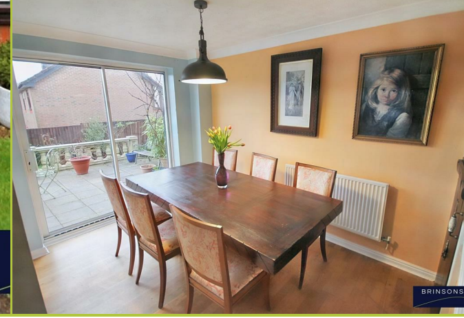
10 Heol-Yr-Ysbyty, Caerphilly, CF83 1TA Price £365,000