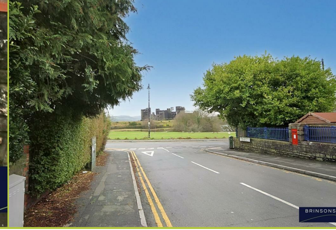
Crescent Road, Caerphilly, CF83 1AB Price £340,000