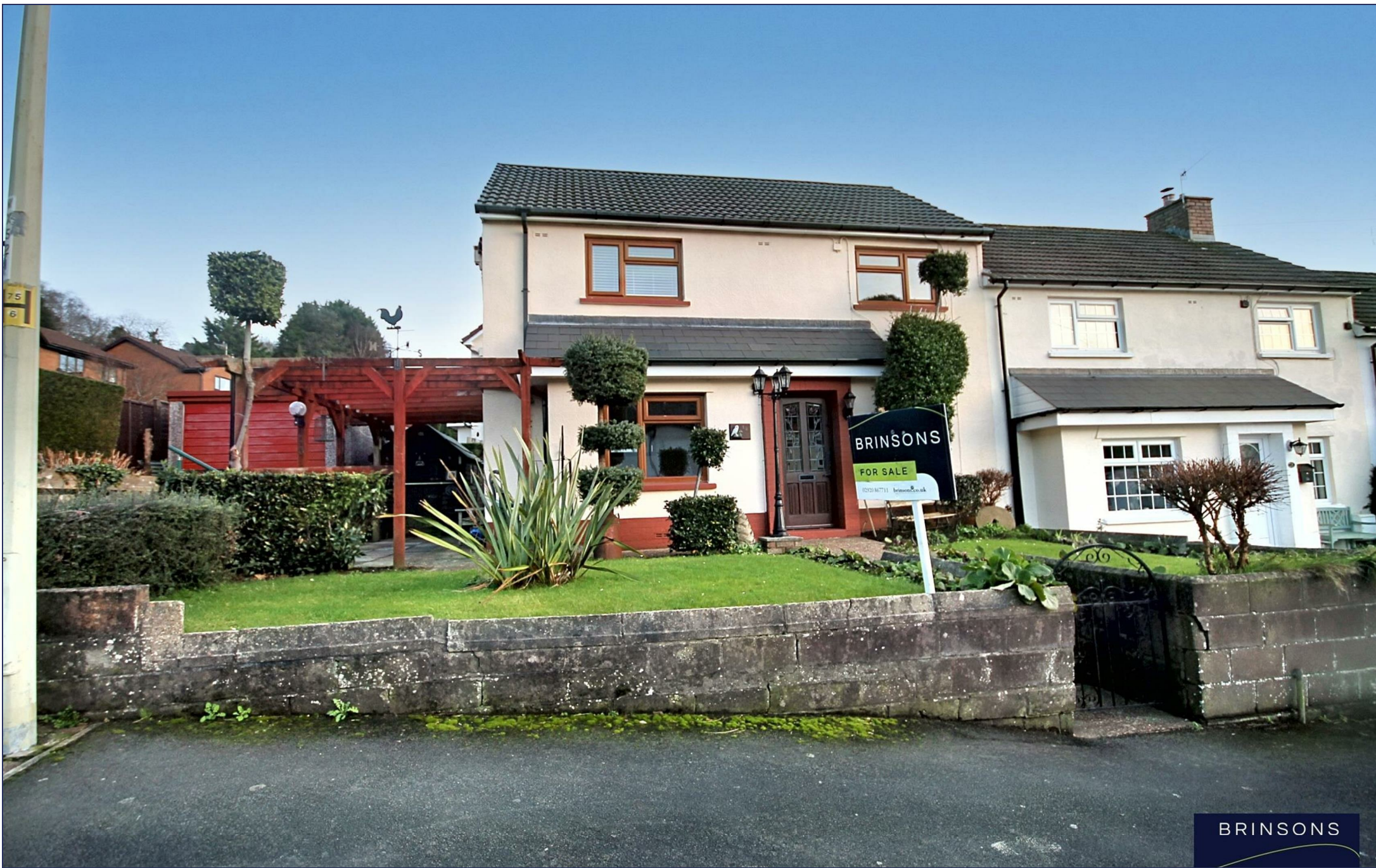
14 Chatham Street, Caerphilly, CF83 8SH Price £290,000