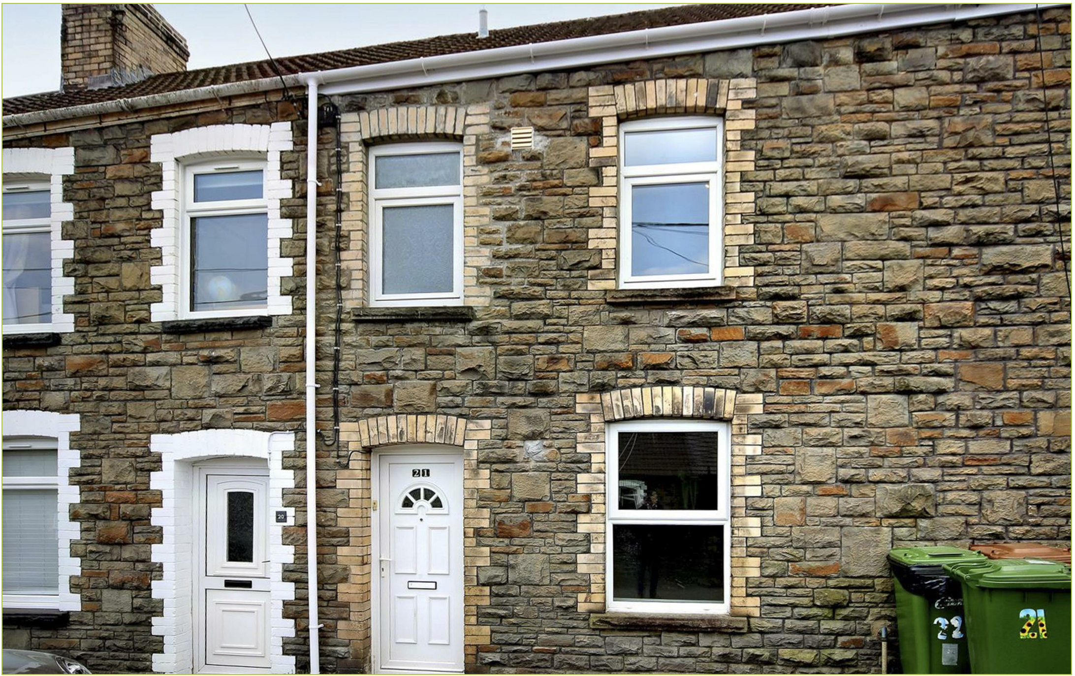
21 Beynon Street, Newport, NP11 4GH Offers In The Region Of £130,000