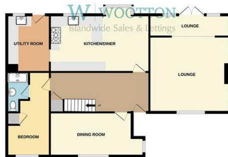
GROUND FLOOR 1088 sq.ft. (101.1 sq.m.) approx.

TOTAL FLOOR AREA: 1837 sq.ft. (170.7 sq.m.) approx. Whilst every attempt has been made to ensure the accuracy of the floorplan contained here, measurements of doors, windows, rooms and any other items are approximate and no responsibility is taken for any error, omission or mis-statement. This plan is for illustrative purposes only and should be used as such by any prospective purchaser. The services, systems and appliances shown have not been tested and no guarantee as to their operability or efficiency can be given. Made with Metropix CS2023