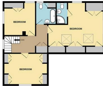
1ST FLOOR 749 sq.ft. (69.5 sq.m.) approx.