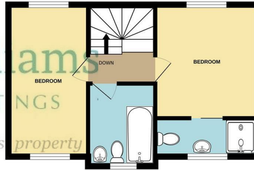
1ST FLOOR 347 sq.ft. (32.2 sq.m.) approx.