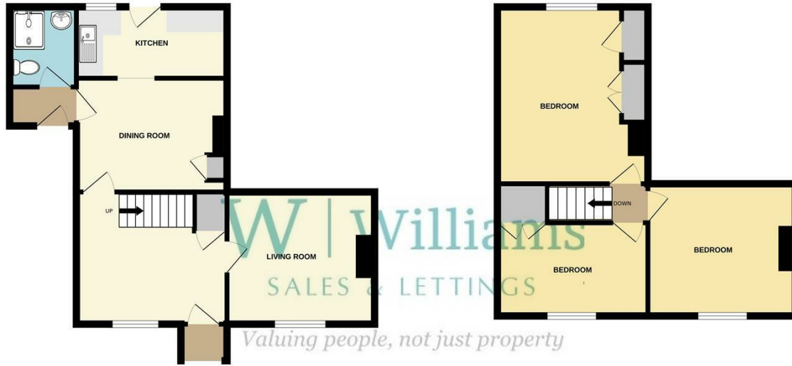
GROUND FLOOR 488 sq.ft. (45.3 sq.m.) approx.