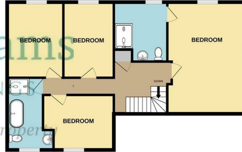
1ST FLOOR 854 sq.ft. (79.3 sq.m.) approx.