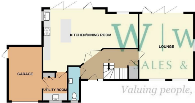
GROUND FLOOR 998 sq.ft. (92.7 sq.m.) approx.