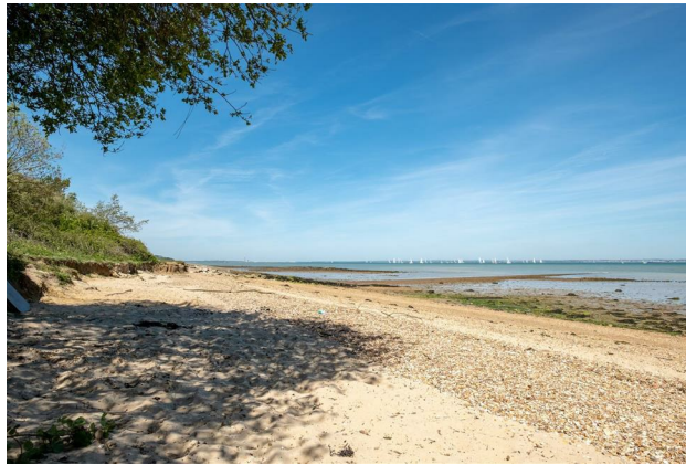
nearby beach and Creek