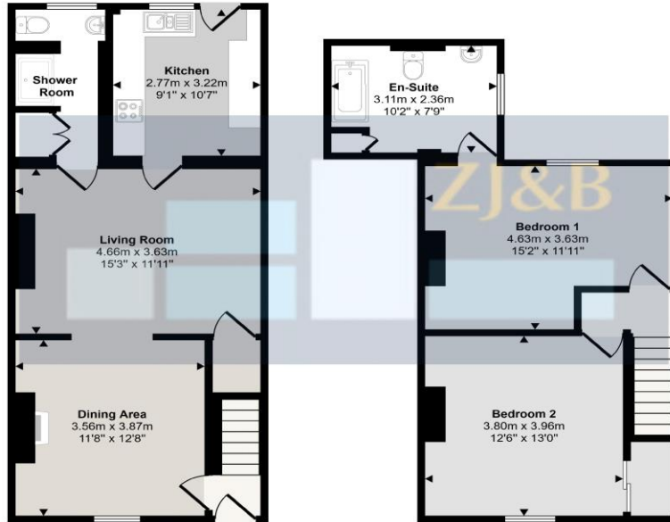
Ground Floor Approx 51 sq m / 549 sq ft