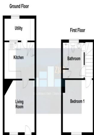
6 Oliver Cottages