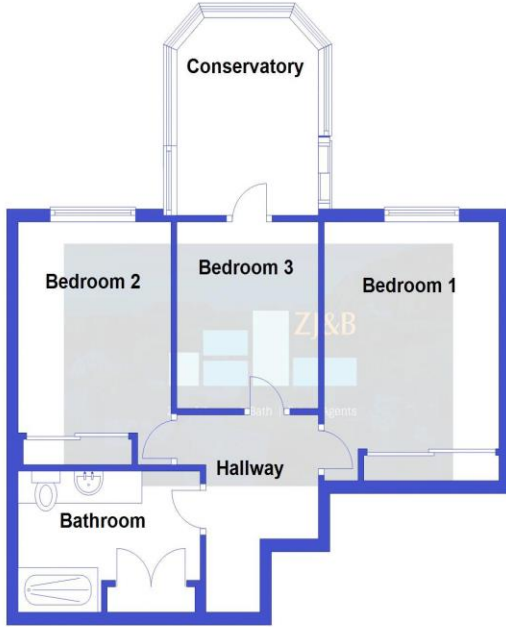
Split Level Ground Floor