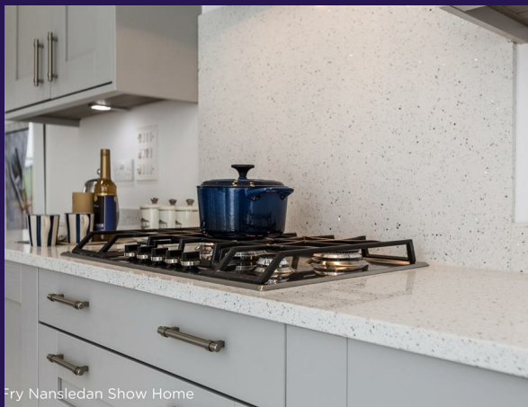
Fry Nansledan Show Home