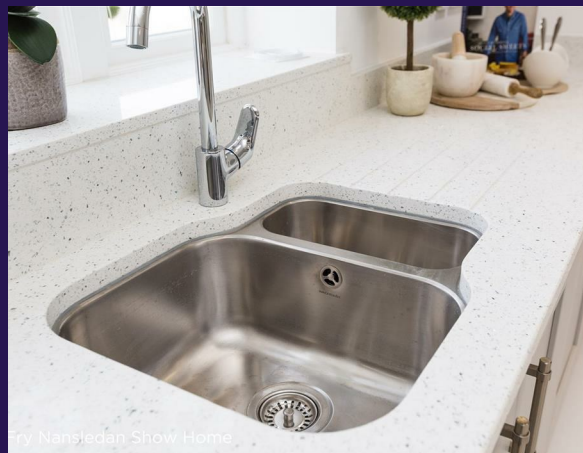
Fry Nansledan Show Home