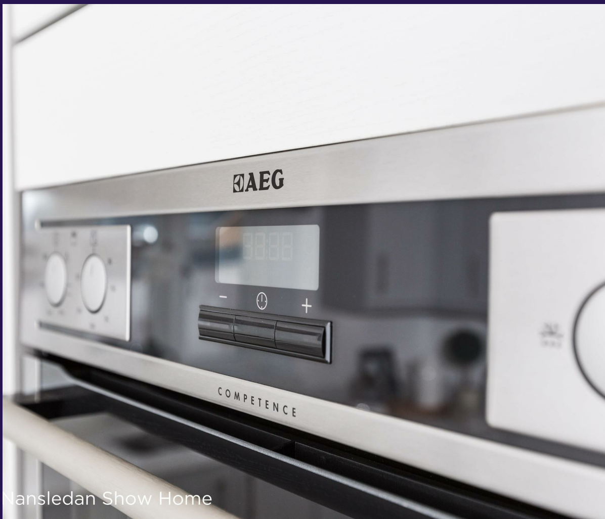
Nansledan Show Home