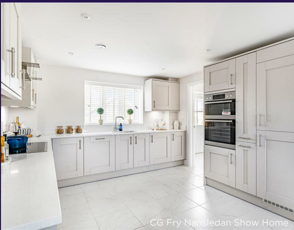
CG Fry Nansledan Show Home