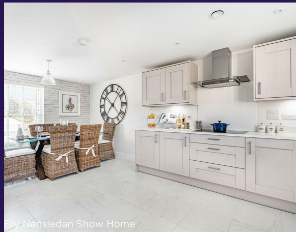
CG Fry Nansledan Show Home