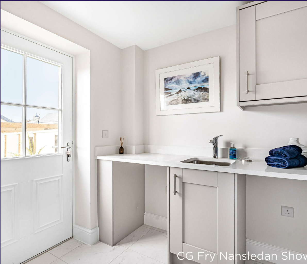
CG Fry Nansledan Show Home