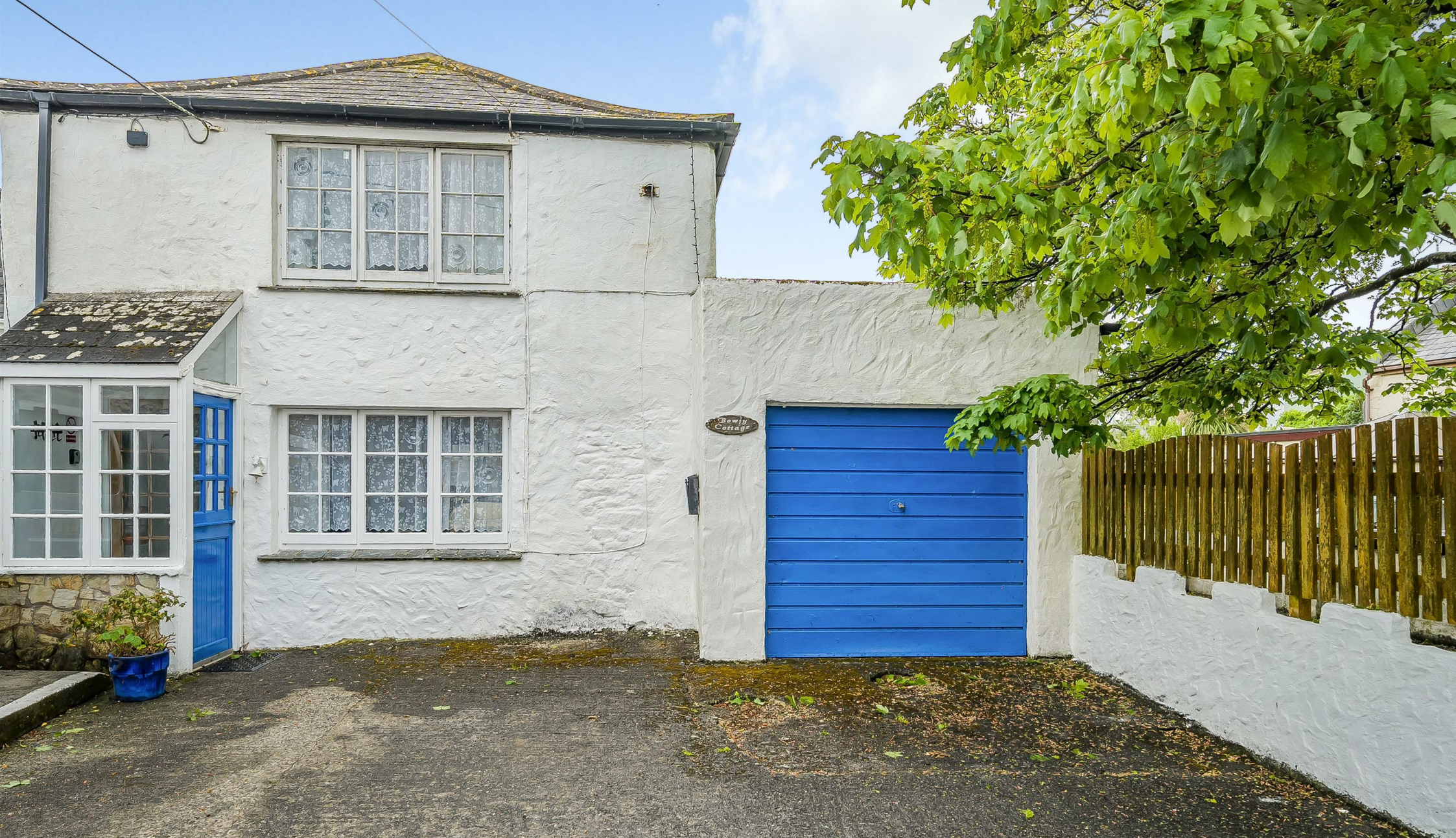
Bowjy Cottage, Cubert, Newquay, TR8 5EZ