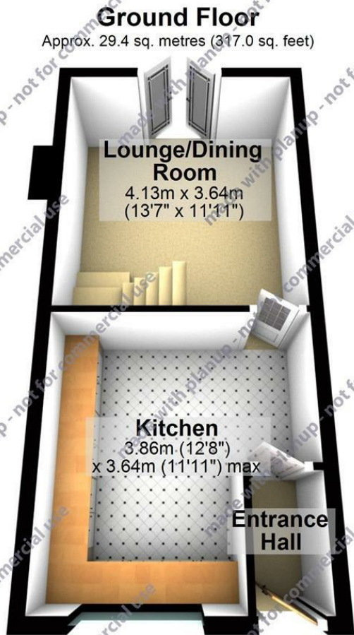
Ground Floor Approx. 29.4 sq. metres (317.0 sq. feet)