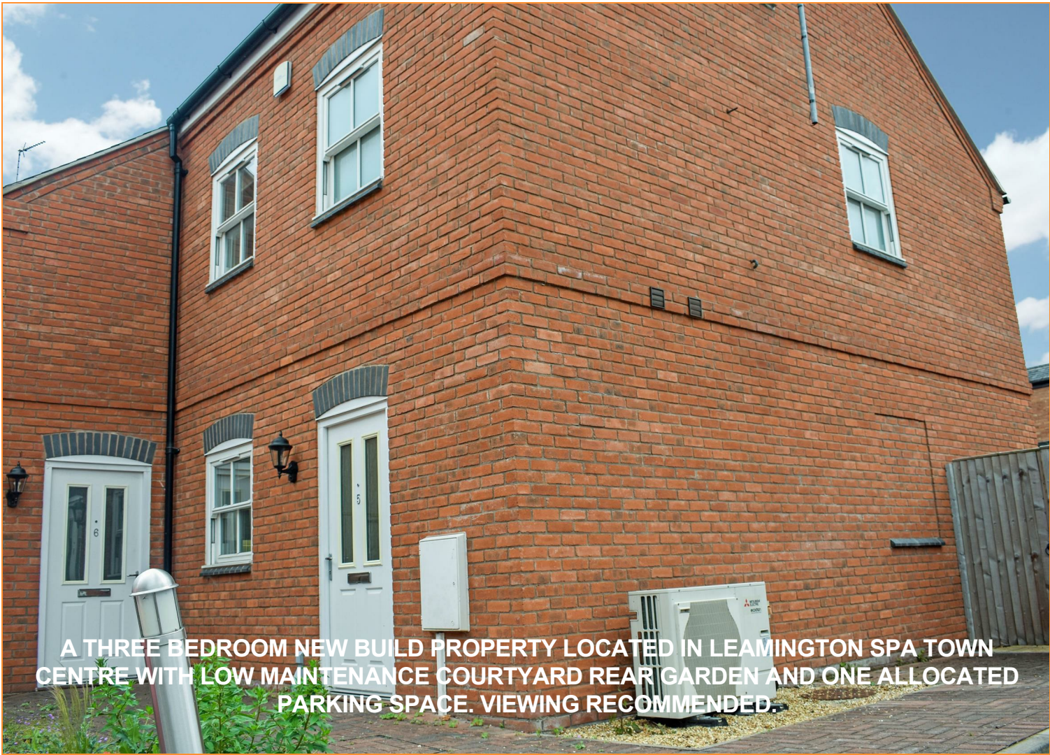
A THREE BEDROOM NEW BUILD PROPERTY LOCATED IN LEAMINGTON SPA TOWN CENTRE WITH LOW MAINTENANCE COURTYARD REAR GARDEN AND ONE ALLOCATED PARKING SPACE. VIEWING RECOMMENDED.