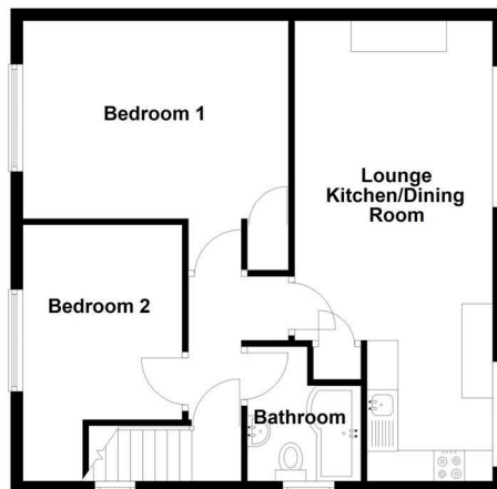
Ground Floor Approx. 596.7 sq. feet