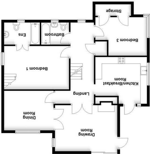
First Floor Approx. 1063.7 sq. feet