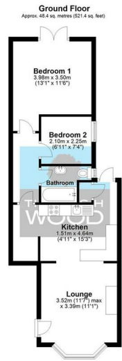
Total area: approx. 48.4 sq. metres (521.4 sq. feet)