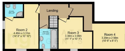
First Floor Floor area 48.0 sq.m. (517 sq.ft.)

Total floor area: 95.8 sq.m. (1,031 sq.ft.)