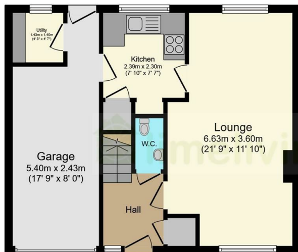
Ground Floor Floor area 51.2 sq.m. (551 sq.ft.)