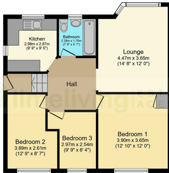
Floor Plan Floor area 67.3 sq.m. (724 sq.ft.)

Total floor area: 67.3 sq.m. (724 sq.ft.)