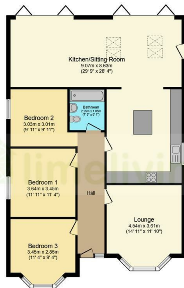
Floor Plan Floor area 117.9 sq.m. (1,269 sq.ft.)