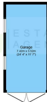
Garage Floor area 26.1 sq.m. (281 sq.ft.)

Total floor area: 144.0 sq.m. (1,550 sq.ft.)