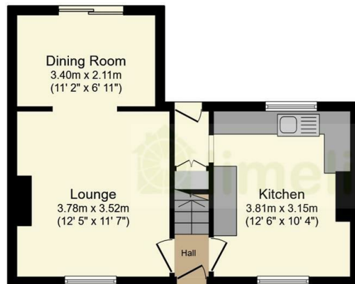
Ground Floor Floor area 36.3 sq.m. (390 sq.ft.)