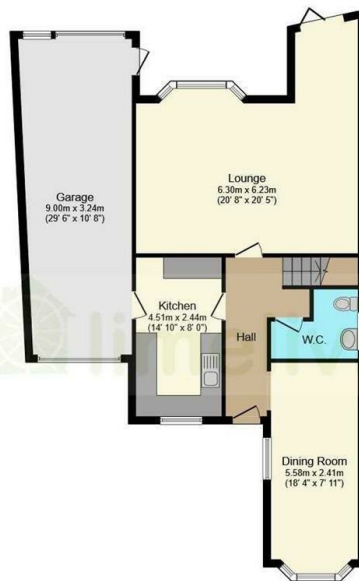
Ground Floor Floor area 99.1 m 2 (1,067 sq.ft.)