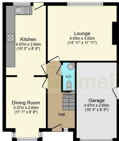
Ground Floor Floor area 61.3 sq.m. (660 sq.ft.)