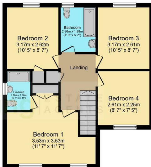
First Floor Floor area 53.1 sq.m. (572 sq.ft.)

Total floor area: 114.5 sq.m. (1,232 sq.ft.)