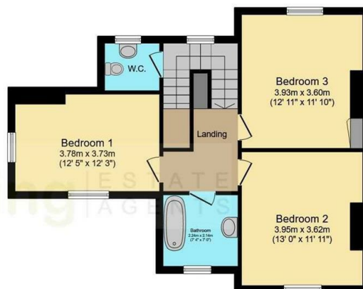
First Floor Floor area 60.4 m 2 (651 sq.ft.)