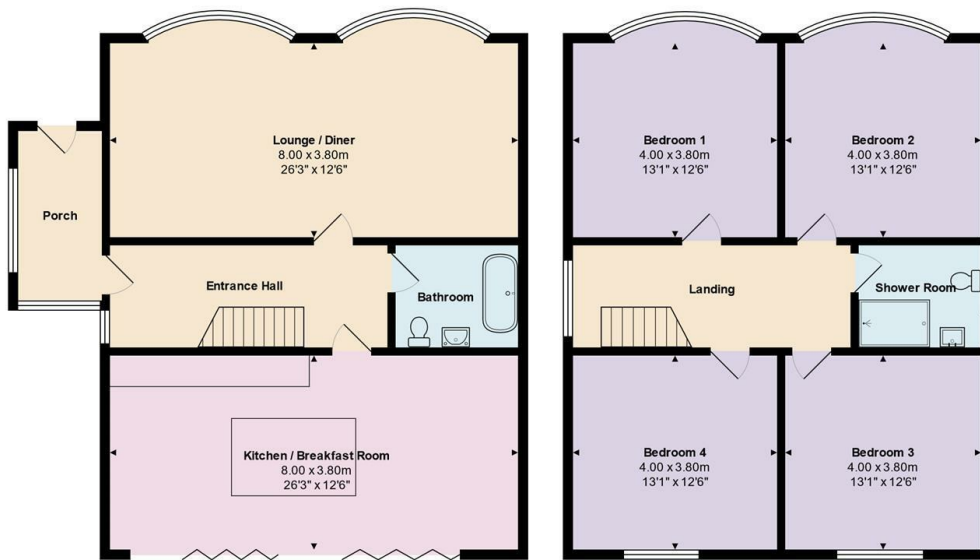
Ground Floor Area: 81.0 m 2 ... 872 ft 2