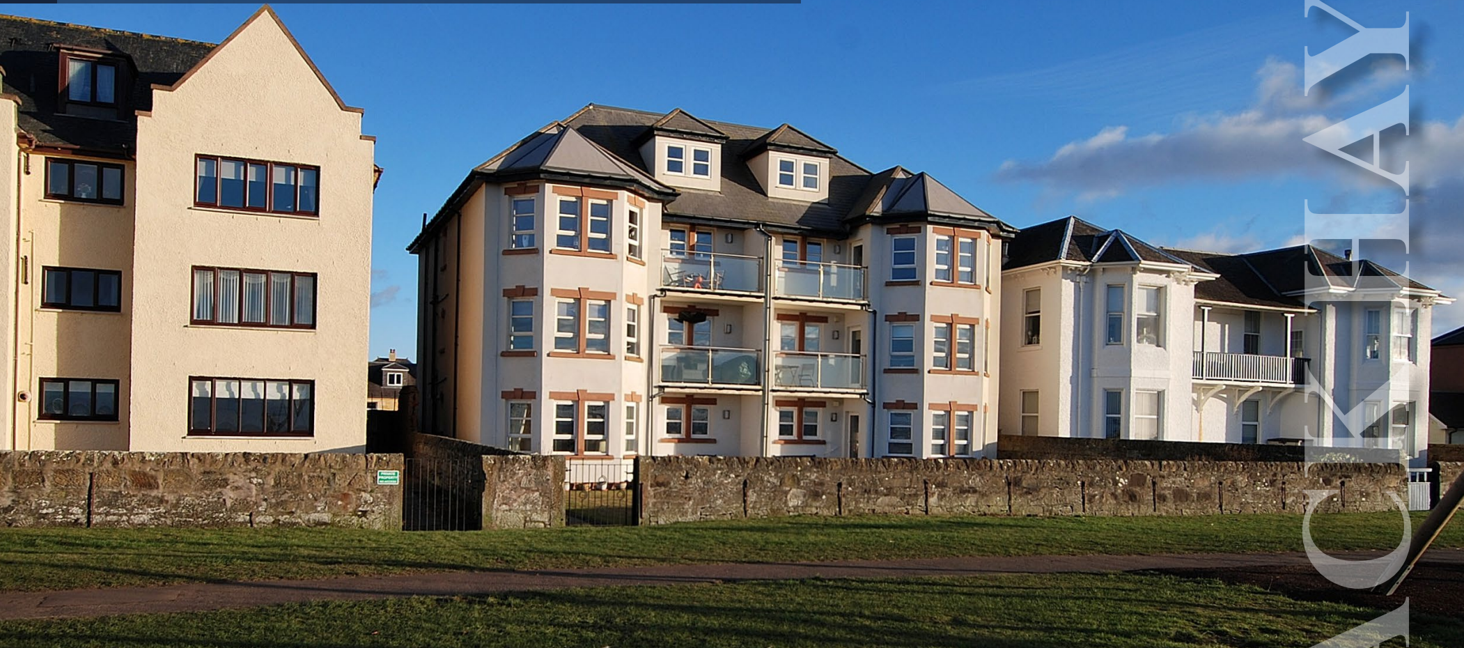
14B ARDAYRE ROAD, PRESTWICK