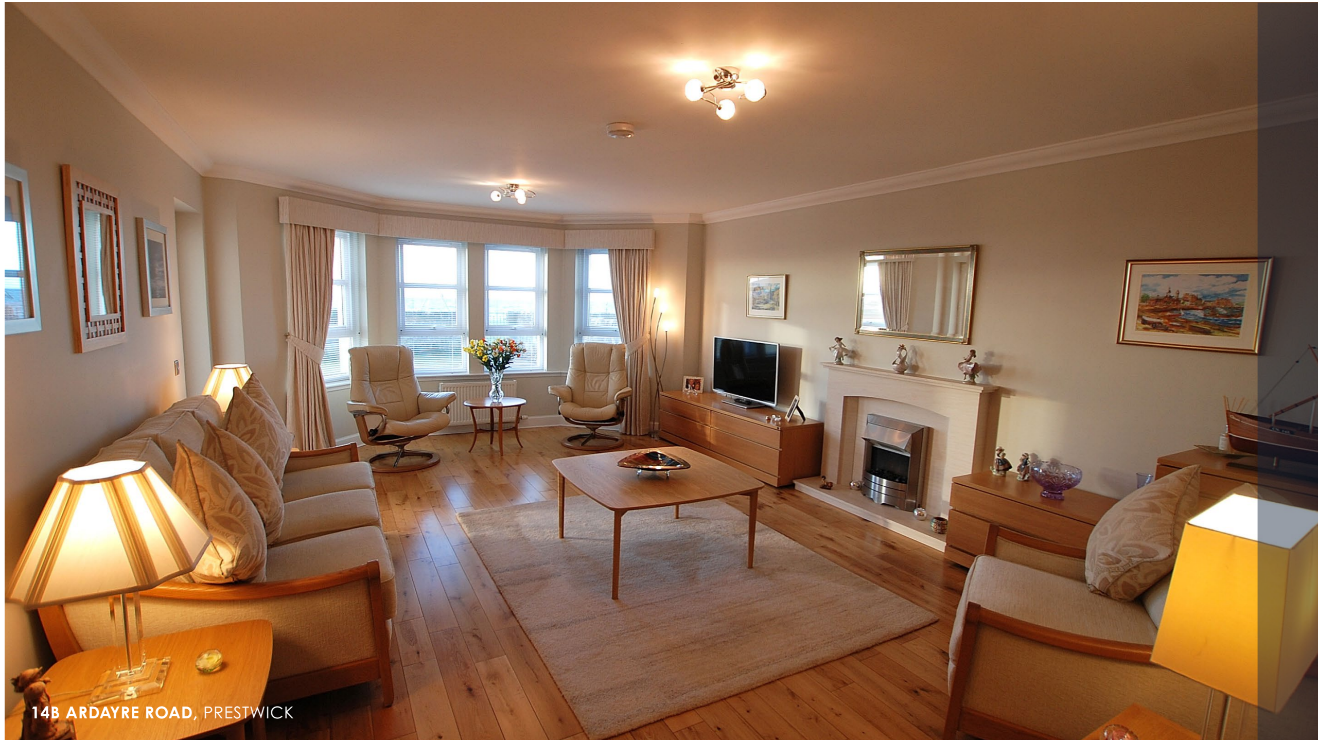
14B ARDAYRE ROAD, PRESTWICK