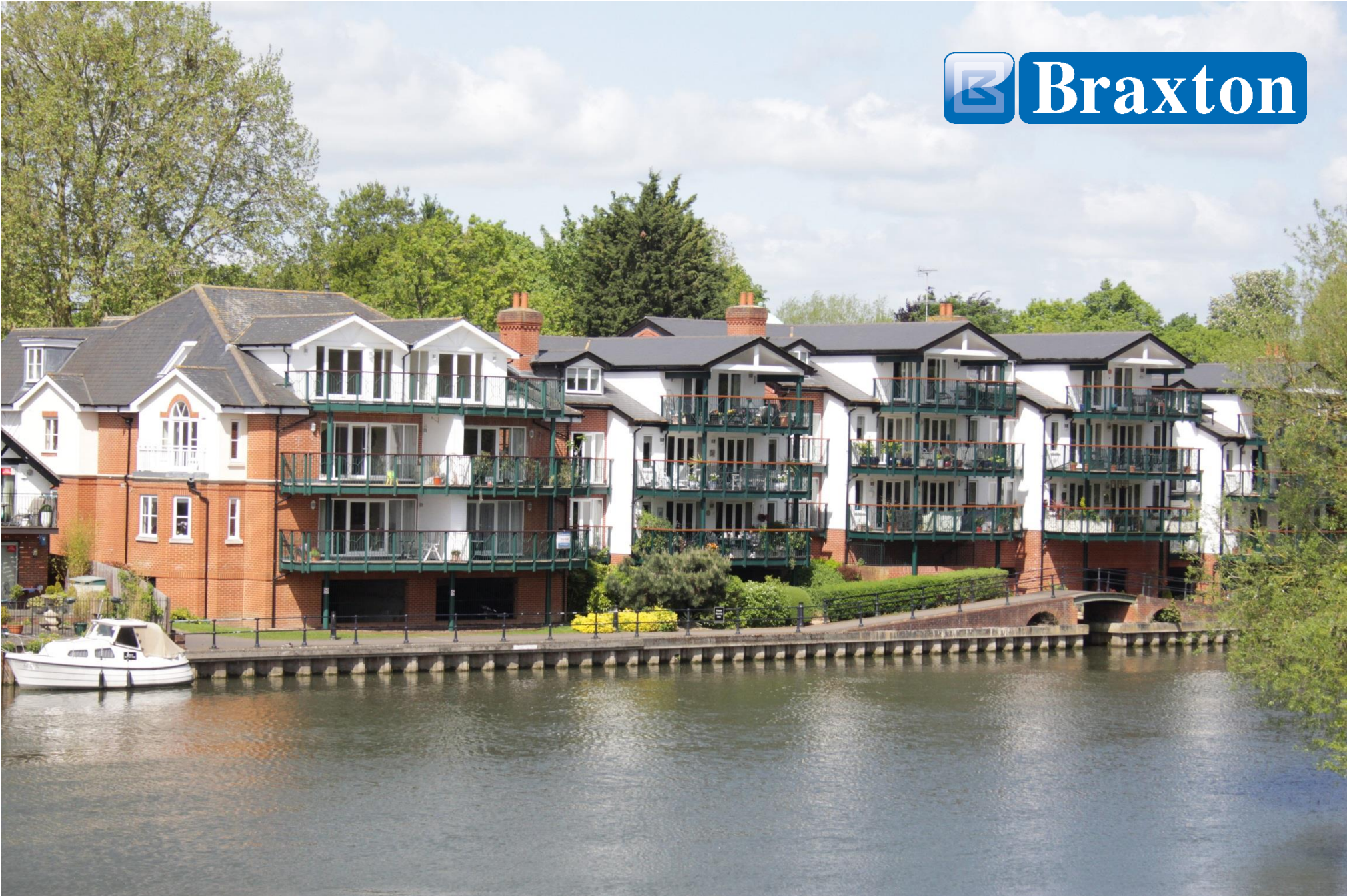
Chandlers Quay, Ray Mead Road, Maidenhead, Berkshire SL6 8NJ