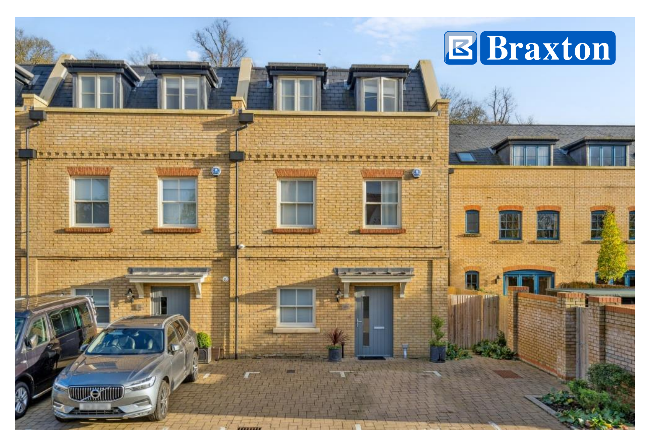
1 JUBILEE MEWS, TAPLOW, SL6 0BN