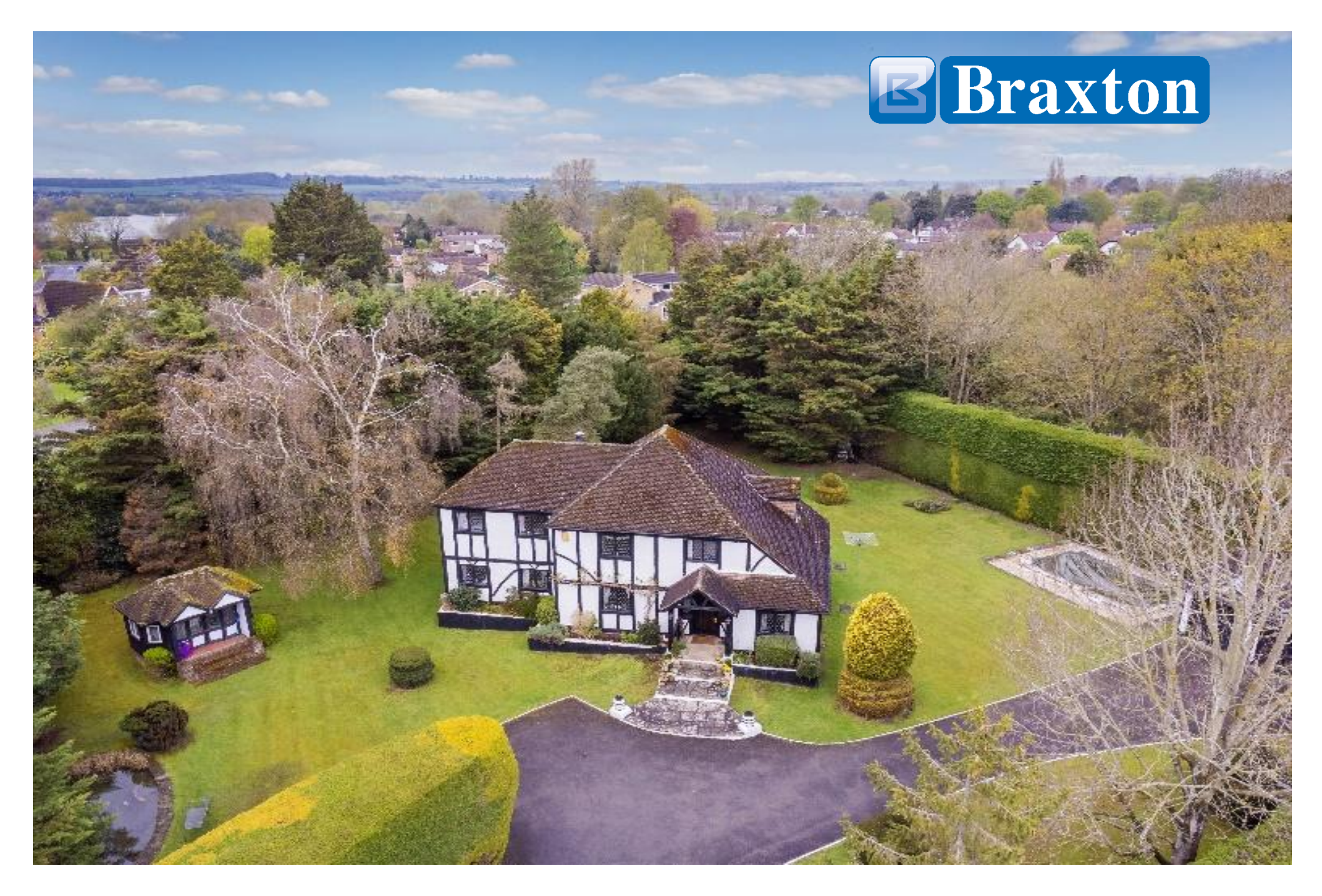
Tudor Lodge, Lock Avenue, Maidenhead, Berkshire SL6 8JW