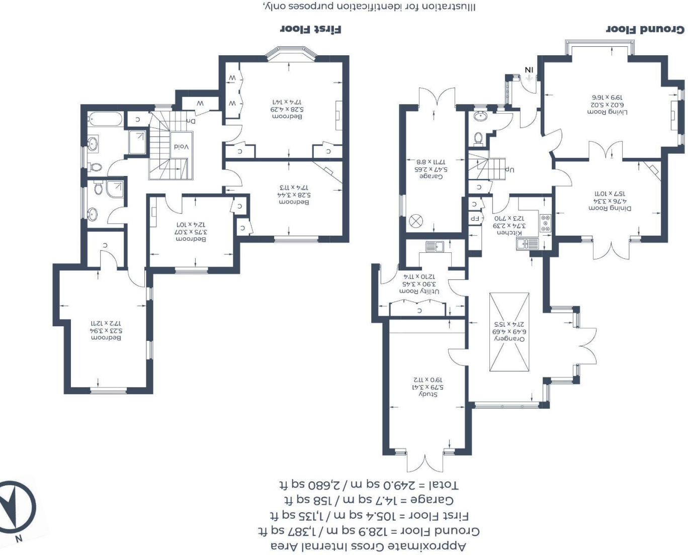
Illustration for identification purposes only, measurements are approximate, not to scale.