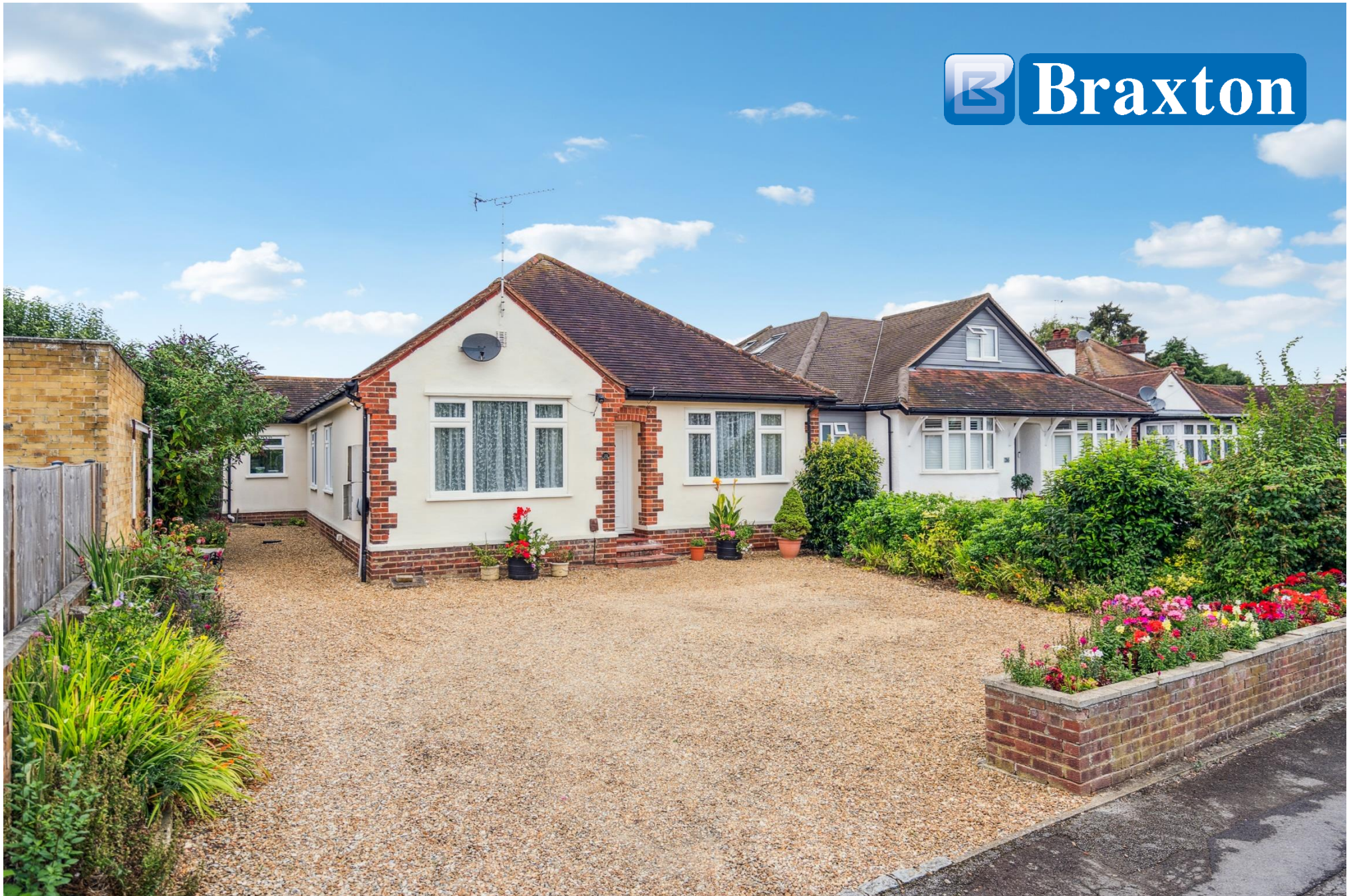
38 Edith Road, Maidenhead, Berkshire SL6 5DY