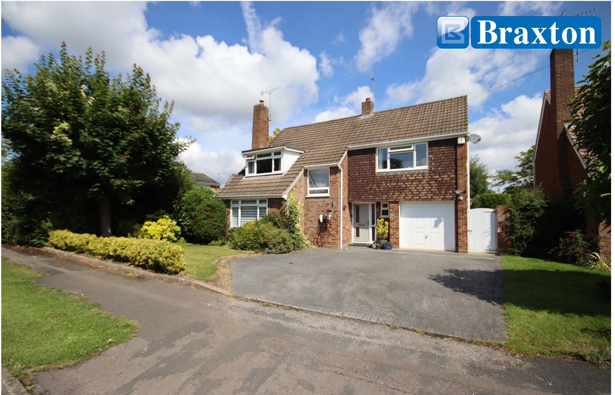
1 Thames Crescent, Maidenhead, Berkshire SL6 8EY