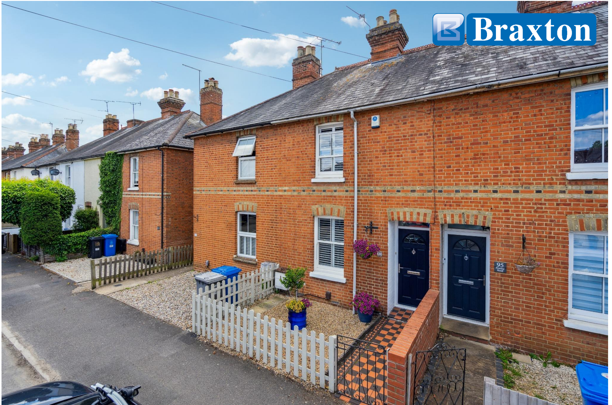
93 Powney Road, Maidenhead, Berkshire SL6 6EG