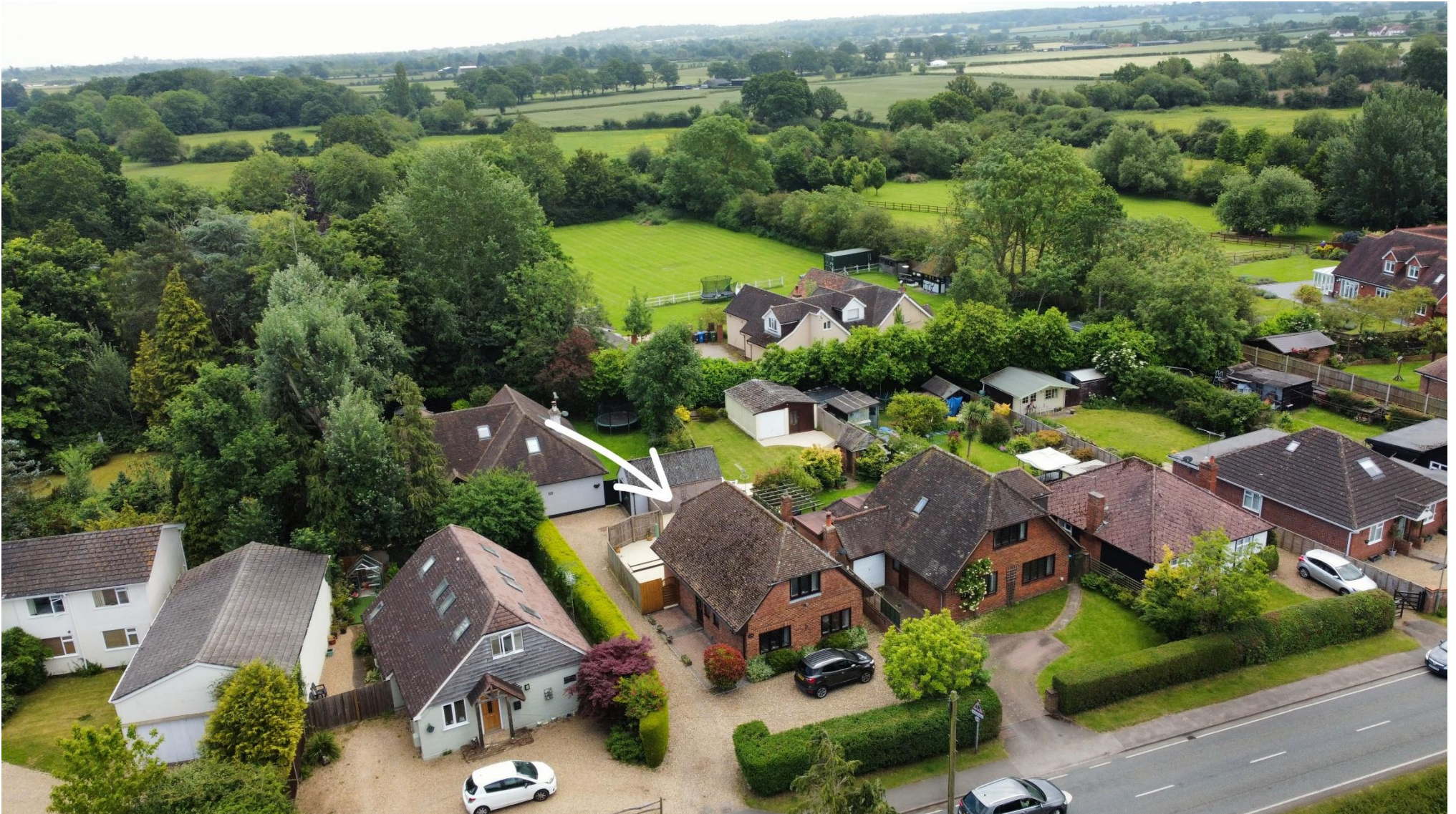
Hollycrest, Money Row Green, Berkshire SL6 2NA