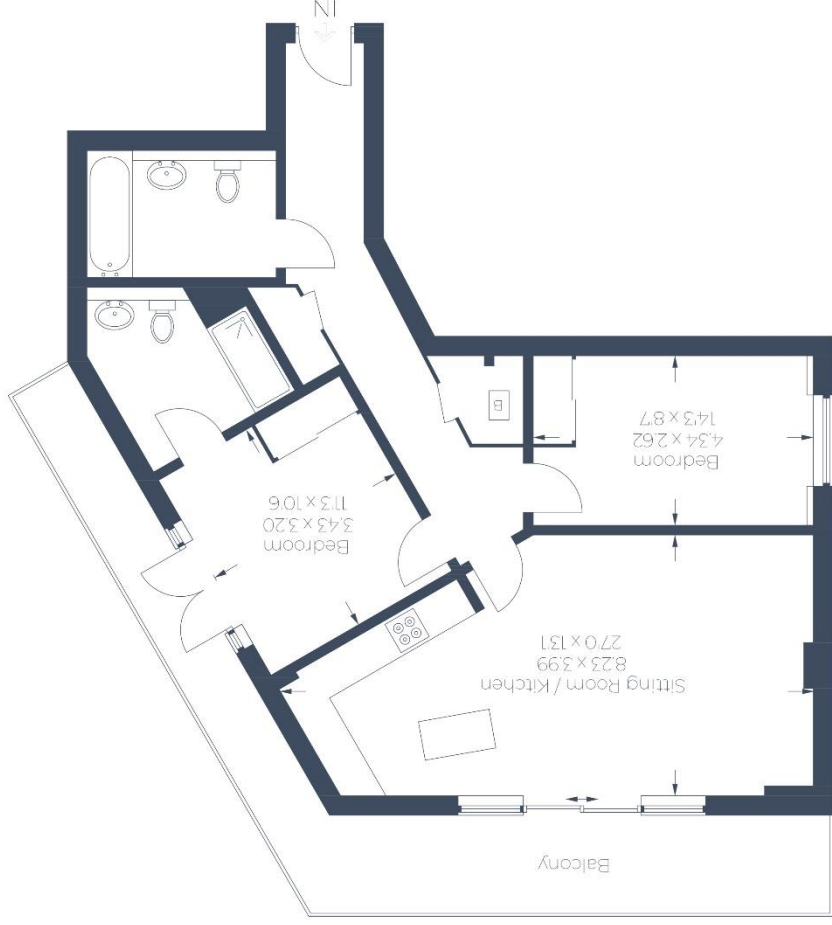
Illustration for identification purposes only. measurements are approximate, not to scale. © Property Marketing Produced for Braxton

For clarification we wish to inform prospective purchasers that we have prepared these sales particulars as a general guide. We have not carried out a detailed survey nor tested the services, appliances and specific fittings. Room sizes should not be relied upon for carpets, furnishings and appliances. Whilst these particulars are believed to be correct their accuracy is not guaranteed and are given without responsibility. They do not form part of any contract.