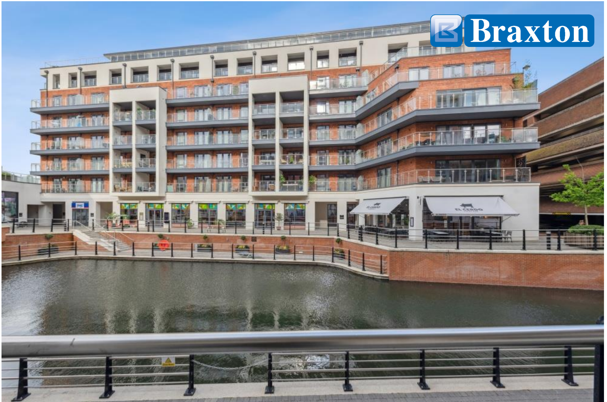
53 Waterside Court, The Colonnade, Maidenhead, Berkshire SL6 1DL