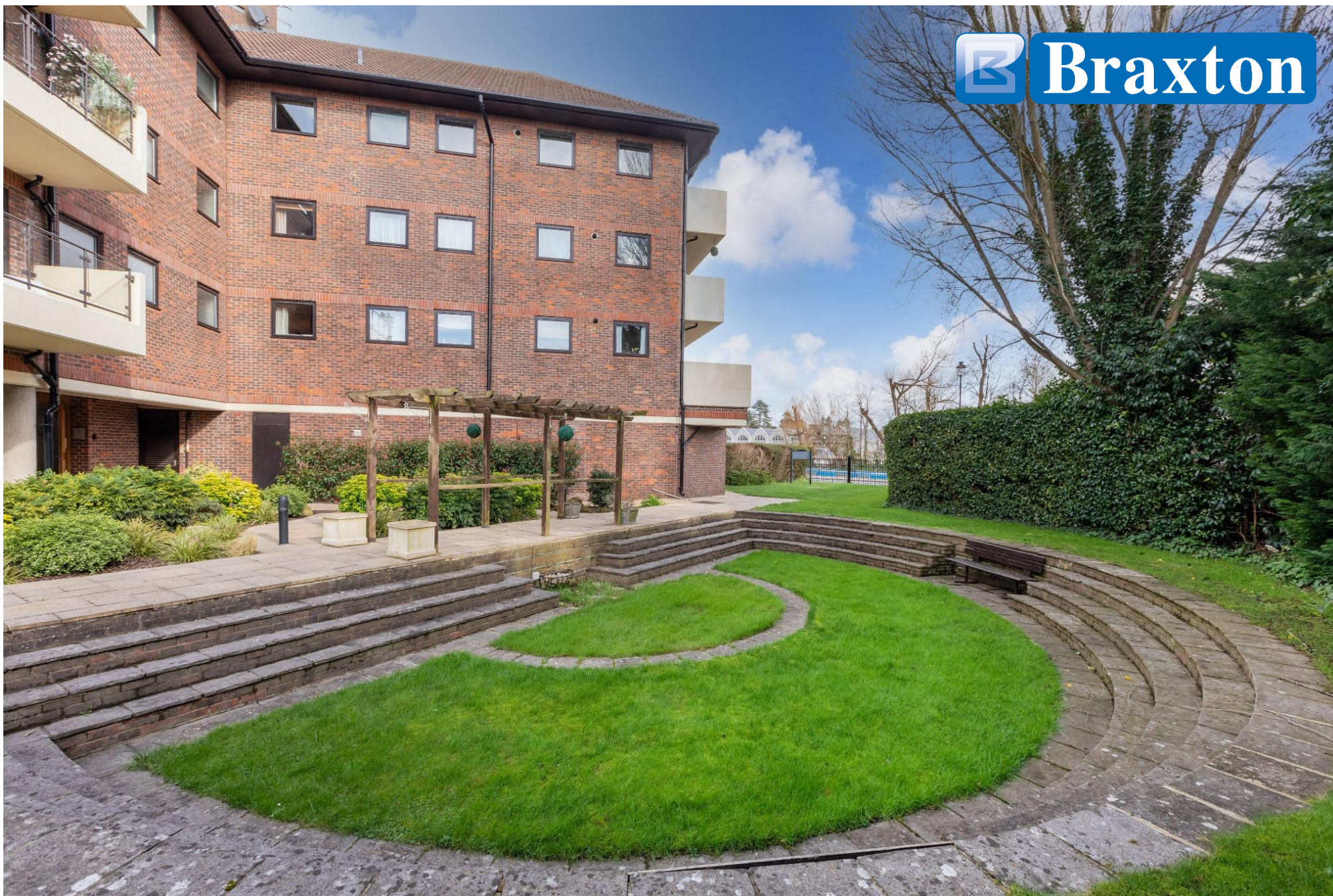
2 Lockbridge Court, Maidenhead, Berkshire, SL6 8UP