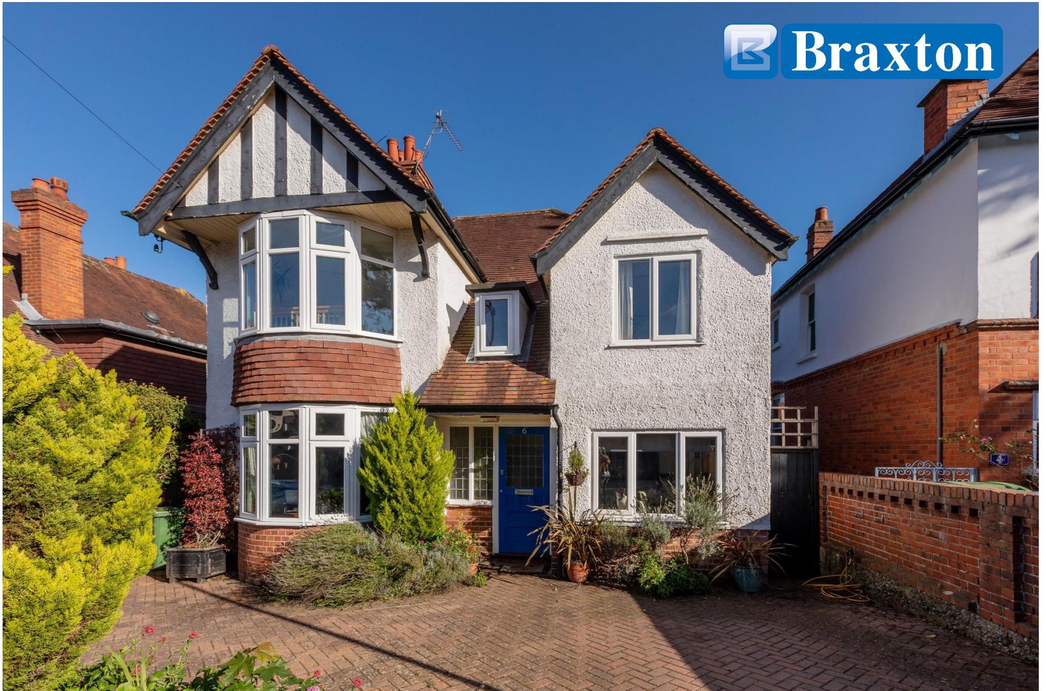
6 Belmont Park Avenue, Maidenhead, Berkshire SL6 6JS