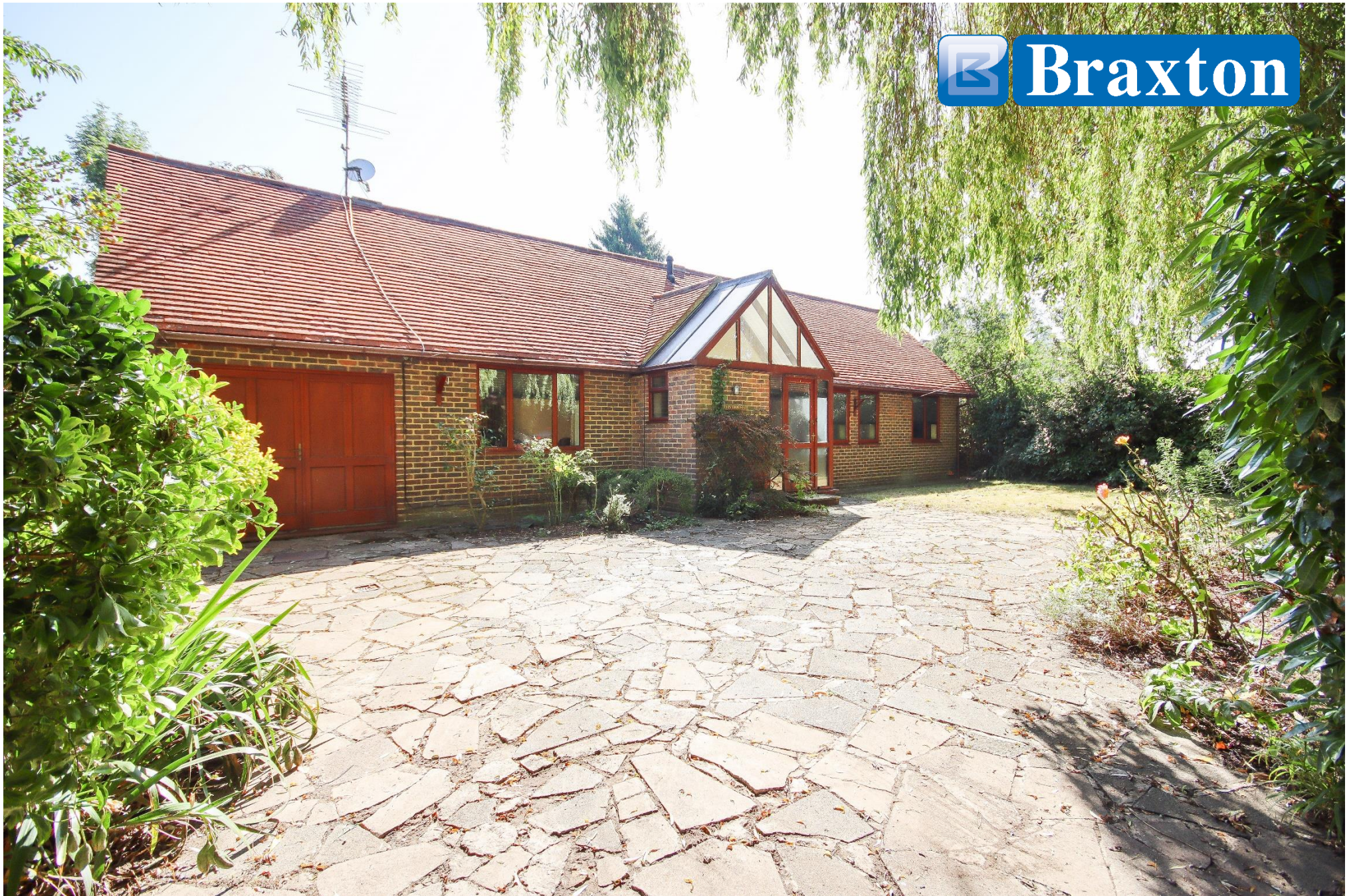
Isis House, Berries Road, Cookham, Berkshire SL6 9SD