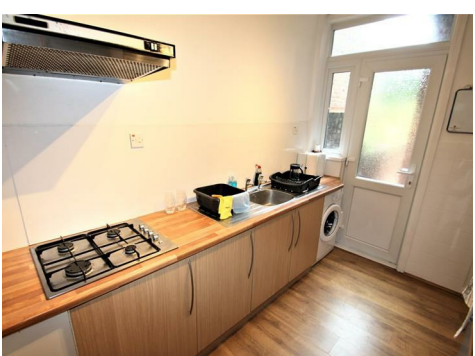
Empshott Road, PO4 8BY £1,400 PCM