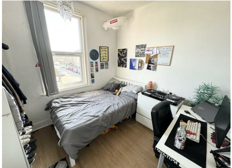
Francis Avenue, Southsea, PO4 0ER £2,300

**STUDENT PROPERTY 2024** **BILLS PACKAGE AVALIABLE VIA UNIHOMES**