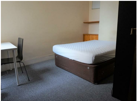
Francis Avenue, Portsmouth, PO4 0HL £2,300 PCM

*STUDENT PROPERTY 2024* *BILLS PACKAGE AVAILABLE VIA UNIHOMES*