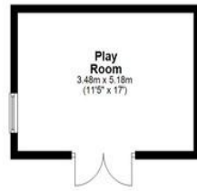
Ground Floor Approx. 114.0 sq. metres (1227.4 sq. feet)